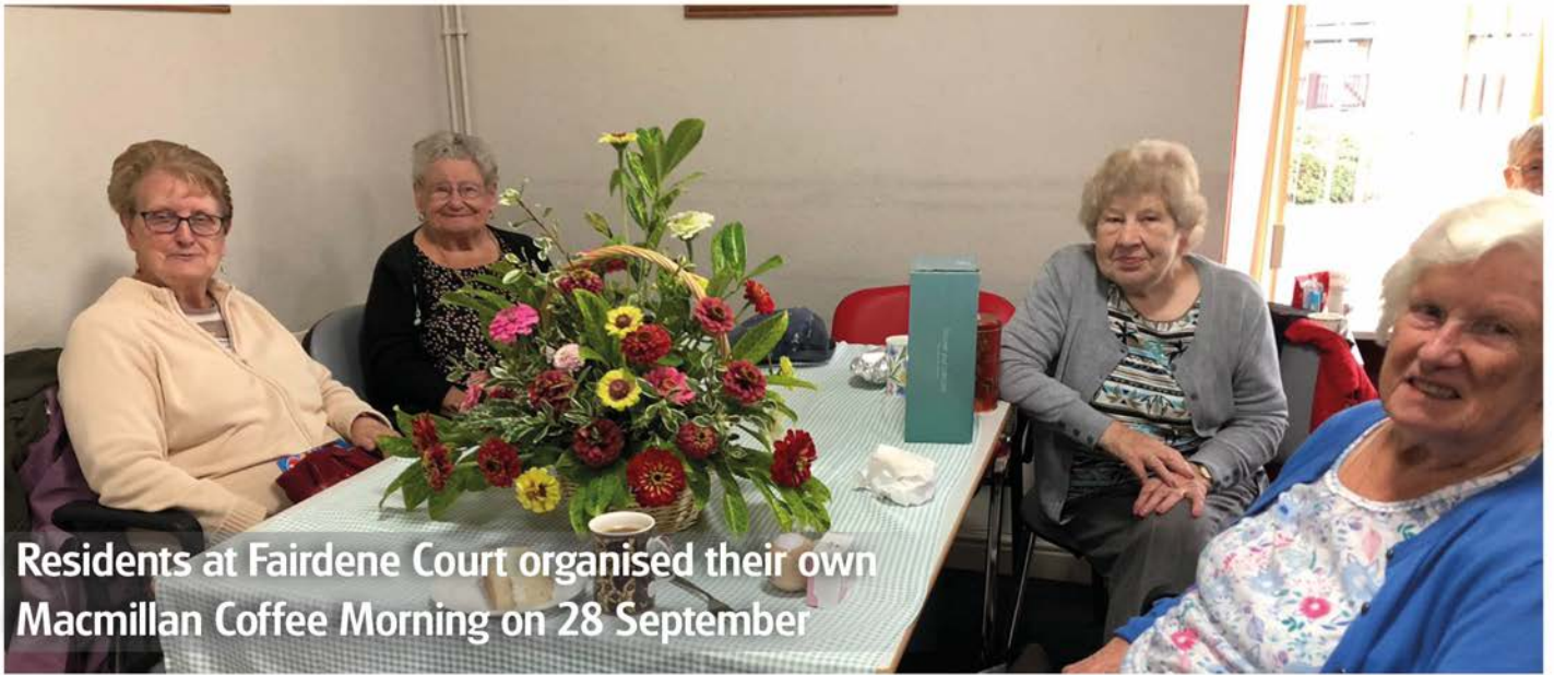
Residents at Faidene Court organised their own Macmillan Coffee Morning on 28 September